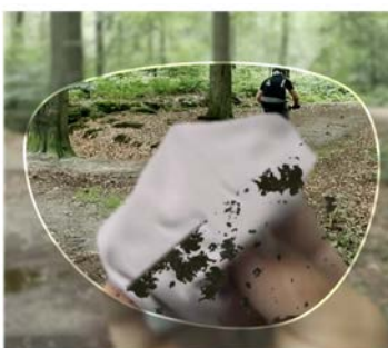
Super HiVision Meiryo EX4