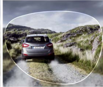
Super HiVision Meiryo EX4